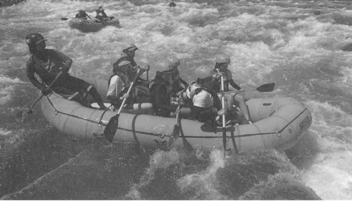
A river guide and his guests on a rafting trip.

pick up a large number of guests. We got in the jeepney and went to the river for the second time.