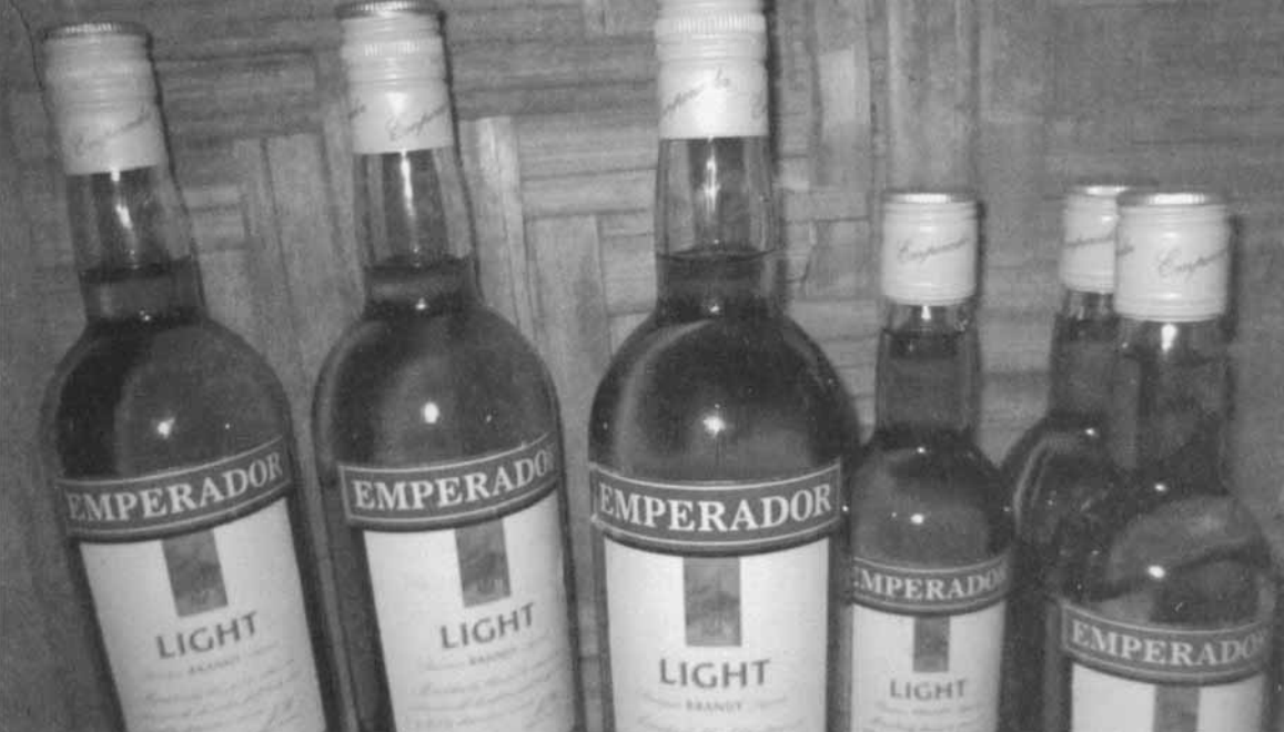
Affordable locally manufactured brandy sold in a sar-sari store in Aura.

rafting. As mentioned earlier, many of them had completed college so there were other job opportunities for them, but they chose to be river guides for the love of the job. Being part of Cagayan de Oro's outdoor community, they considered river guiding not only as a job but also as a fulfillment of their passion.