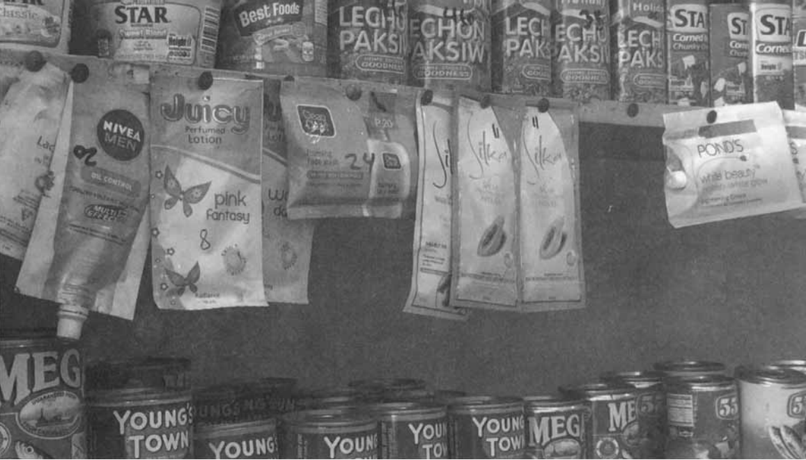
Daily necessities. Personal care products in sachets and canned food products are sold in a neighborhood sari-sari store.

cosmetics, body care products, pharmaceuticals, vitamins, food supplements, alcoholic and energy drinks, and nicotine products. Marcel Mauss (1934 [1973]) introduced the notion of techniques of the body, how aspects of culture are embodied or anchored in daily practices of individuals, groups, and societies, contemplating the totality of learned habits, bodily skills, styles, and tastes. For Merleau-Ponty (2012) the body is an anchor of representations and as a ground of being-in-the-world. We take the notion that the chemical use of young people form part of their techniques of the body reflecting the larger world they live in.