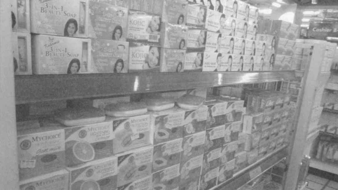
A variety of soaps to choose from.