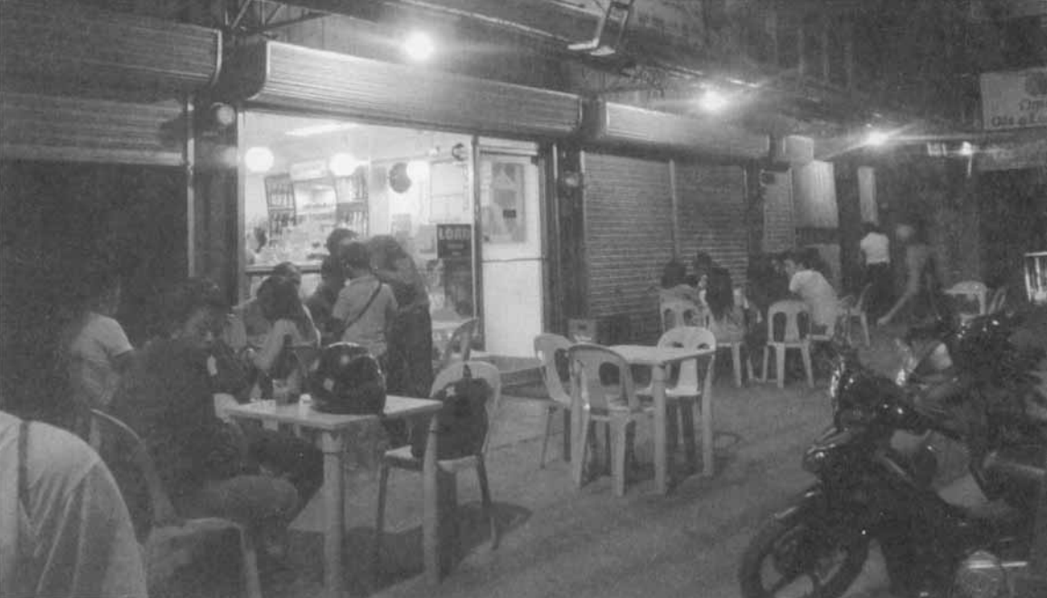
Happy Tee on Corrales Street brings out tables and chairs at night to create a makeshift bar.

say that drinking without smoking is disgusting). Drinking leads to smoking, vice versa (Chloe and Raymundo 2001).