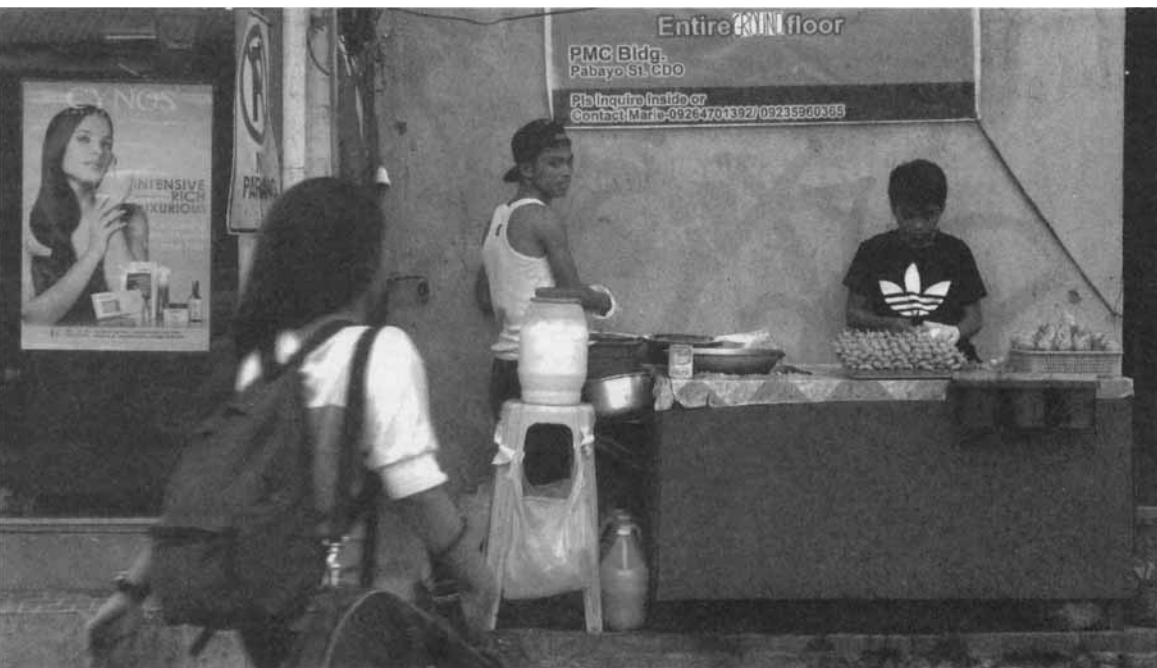
Street food stall along Pabayo Street.

Most of the drivers and vendors are migrants from Lanao del Norte, Lanao del Sur, Agusan del Norte, Agusan del Sur, and Camiguin. They felt the need to earn money to help their families with the household and educational expenses while they were still in elementary school. Before they started selling street foods, male food vendors tried working as kargador (porter), construction worker, or planting crops. They described their previous jobs as “ mahirap, eh ” (difficult), “ di malaki ang kita ” (the income was small), and “ walang pang-aral ” (no money for education). It was difficult to find jobs with decent pay in their hometowns because of their low educational qualifications. They felt the need to explore more job opportunities in bigger cities to be able to fend for themselves and support their families. This meant for some of them having