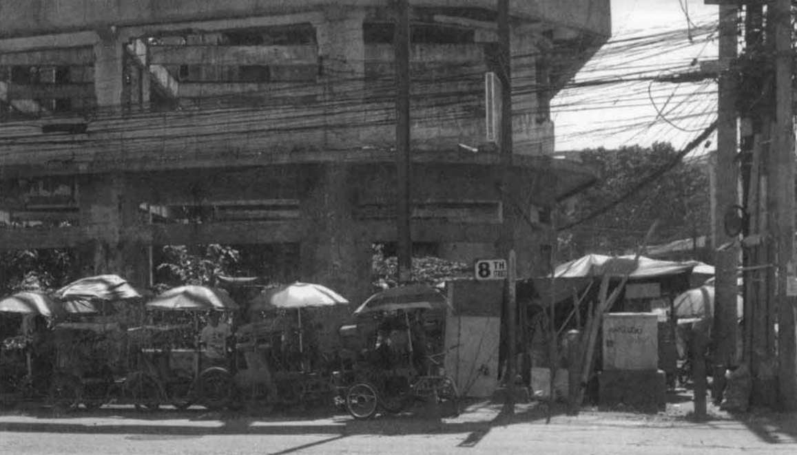
A group of sikad drivers waiting for their turn to accommodate people at the Cogon market.

The sikad , which can transport people to short distances, are usually found in terminals near markets. They are not allowed in the city's highways so the drivers usually accommodate people who live near their assigned stations and routes, such as those at the Cogon market. The regular fare in a sikad ranges from twenty to fifty pesos, depending on the passenger's destination. Most of the sikad drivers we interviewed bathed, ate, and slept at the Petron gas station located across the area where they parked their sikad . They did not own the sikad they drive, they lease the sikad for 1,500 pesos per month.