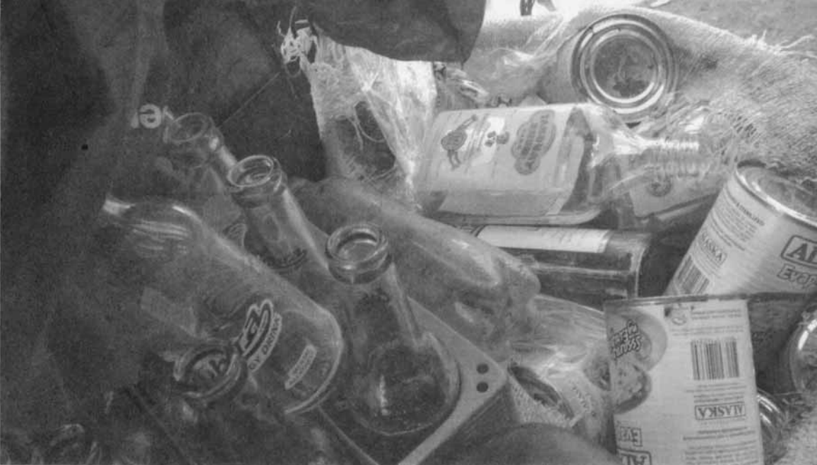
Empty bottles of energy drink and local rum and cans of milk collected near the sikad terminal.

they were selling. They had the knowledge and experience in making and selling street foods. Chicken proven (Lubos 2014) vendors underwent seminars on sanitation and food safety conducted by the health office of the city. They were told to keep their stands clean at all times to avoid contamination and making the customers sick. They prepare clean, cheap, and tasty food. They were particular about the temperature of the oil they used for frying and the spiciness of the sauce, especially for Muslim customers.