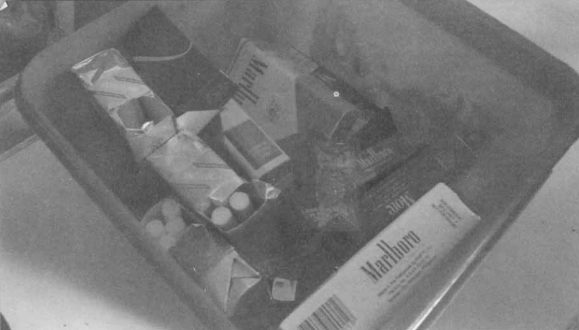
Cigarette stash. For sale in a minimart adjacent a university.