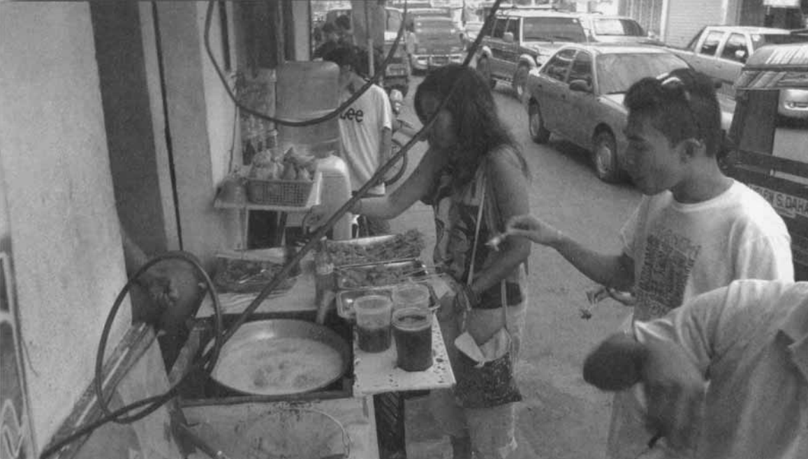
Customers trying out the chicken proven.

Working round the clock made them very tired. To deal with this, they had to employ strategies that included taking energy drinks.