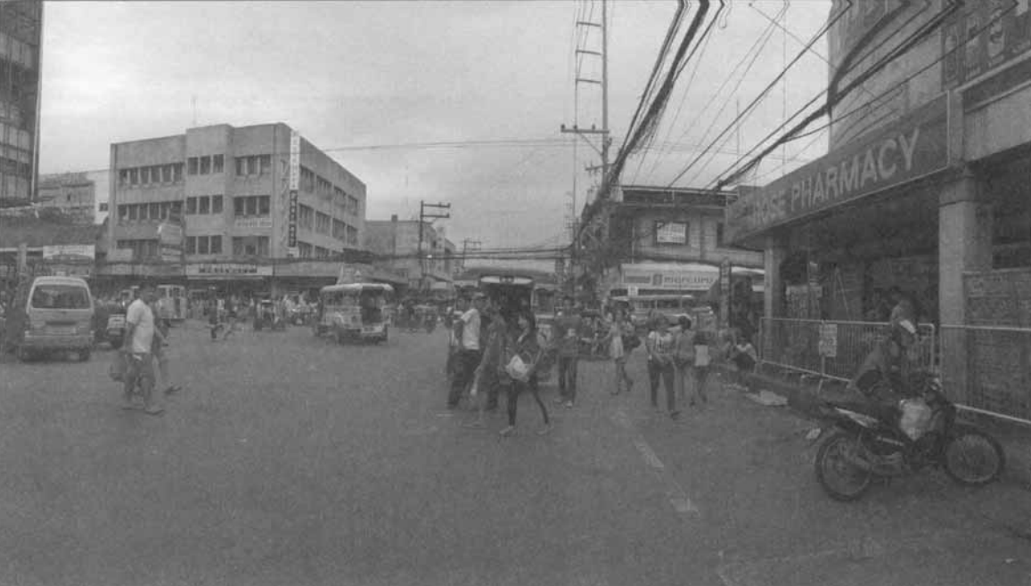
Several pharmacies within the same vicinity at Cogon Market.

lotions, shampoos, and slimming agents. Beauty shop workers serve double roles as both stockers and salespeople, they are in charge of storing, arranging the display, inventory, and selling.