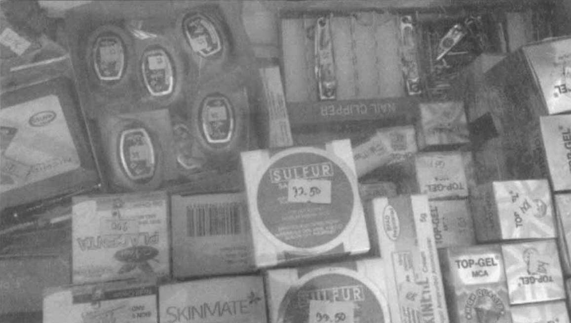
Some of the skin-whitening products sold in a pharmacy.