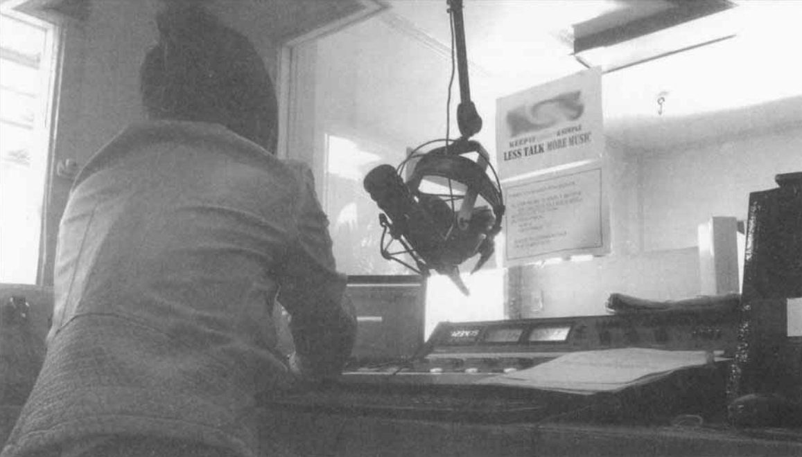
"DJ" at work.

job, she worked as an office secretary, as an in-house DJ for a local shopping center, and as a clothing store employee. When she joined the radio station as a disc jockey she signed a contract and was placed on probationary status for six months. Eventually, from a budding DJ she became a "regular" employee of the station.