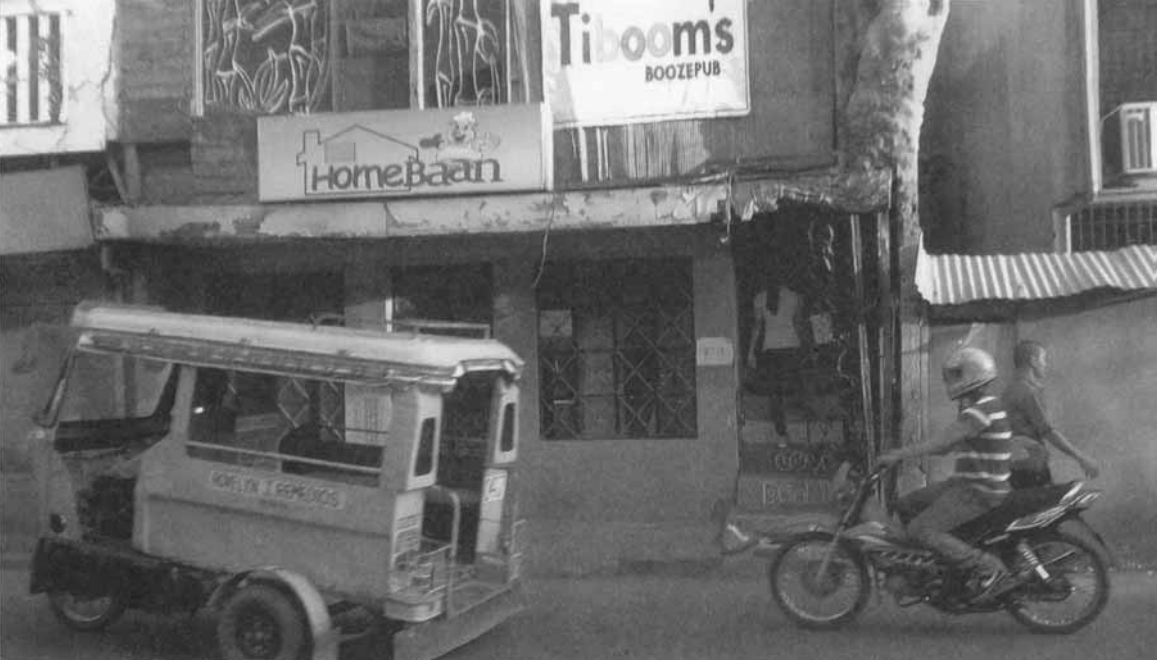
Tiboom's Boozepub, the only one of its kind in the city.

can no longer be kept hidden in the dark for long. Still, one needs to be reminded that “although the country has gained the reputation of being tolerant of gays..., some lesbian couples still consider themselves stigmatized in the Philippines” (Lam 2010, n.p.).